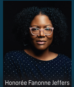
Honorée Fanonne Jeffers